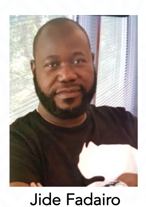
Over 20 years experience leading technology efforts MSc. ITIL Expert CTO